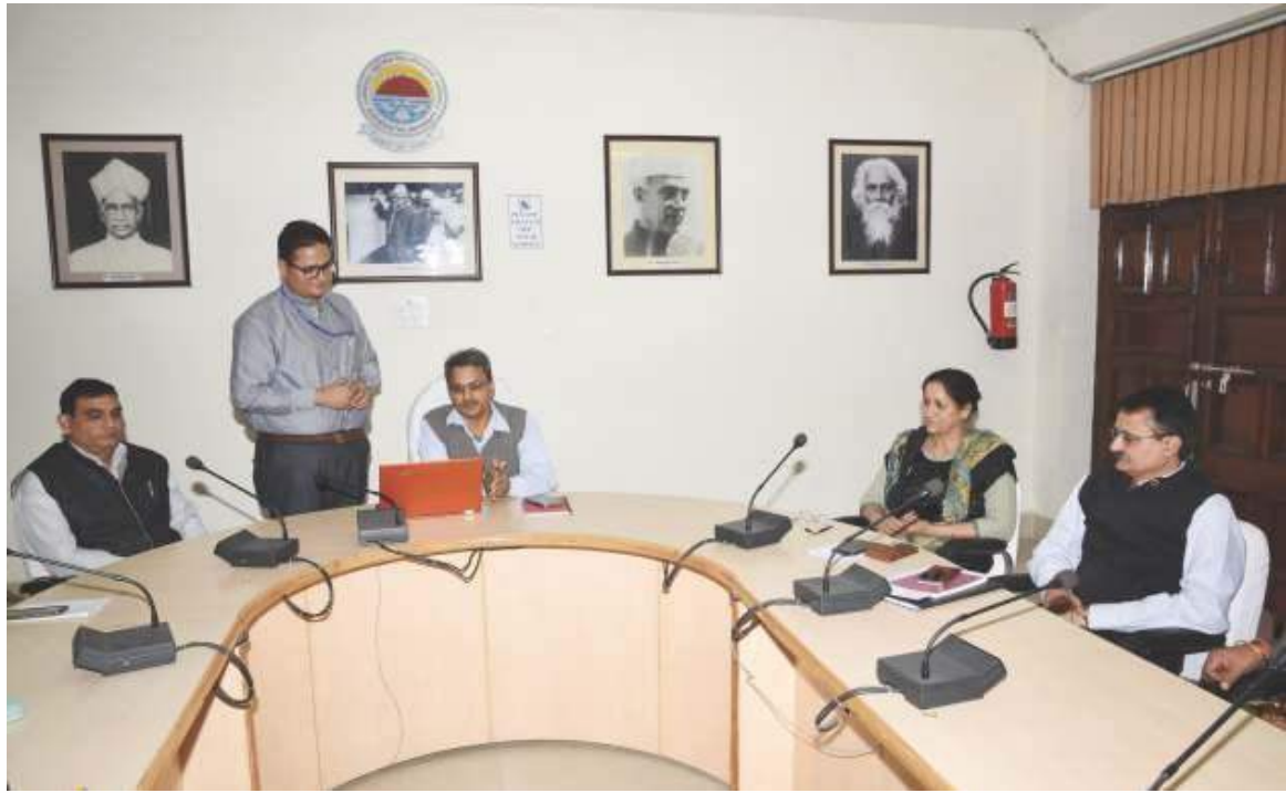
Launching of Bulk SMS Service of Directorate