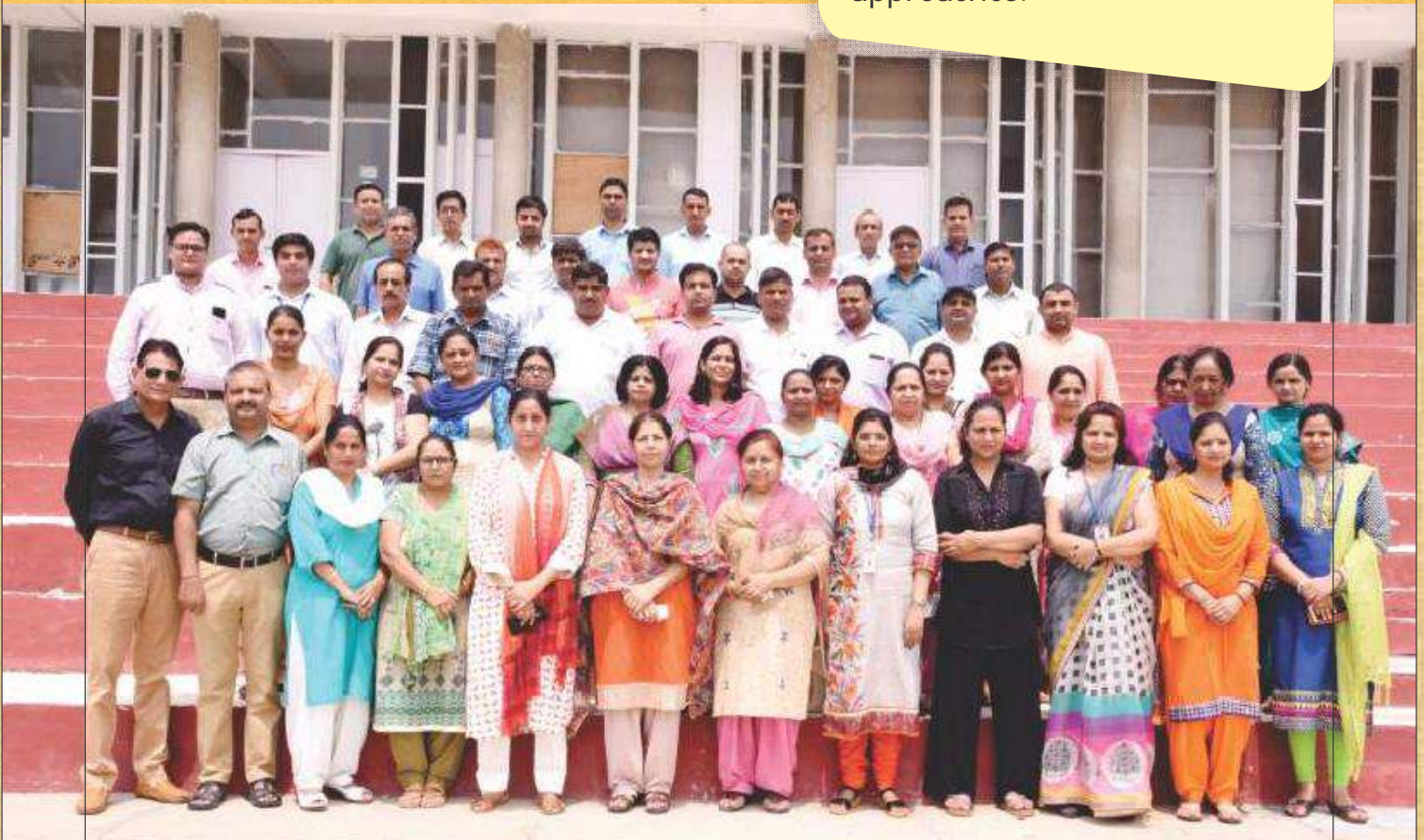
Team of Directorate of Distance Education, Kurukshetra University, Kurukshetra

To evolve a seamless system of higher distance education for sustainable life-long learning and up gradation of knowledge and skills by use of innovative approaches.