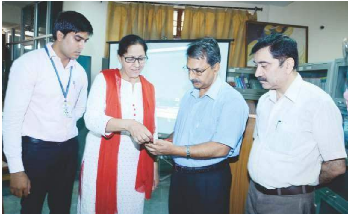
Launching of Mobile Application - DDEKUK